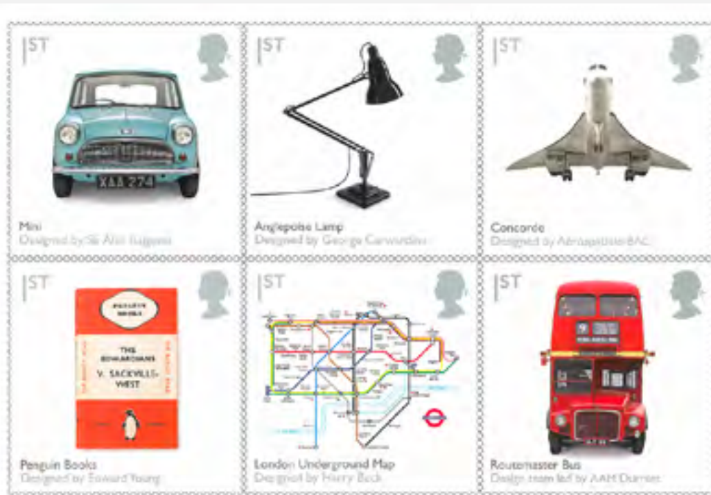
2009: Royal Mail stamp collection issued to celebrate British Design Classics, includes iconic Anglepoise® Original 1227™ design.

In 2009, in recognition of its iconic status, the Original 1227™ is featured on a Royal Mail stamp collection alongside other pioneering British designs, including the Routemaster Bus, the K2 Telephone Kiosk, the London Underground Map and the Mini.